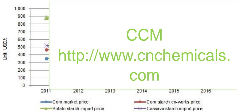
Figure 4.2-6 Price changes of key raw materials for China's modified food starch, 2011-2016