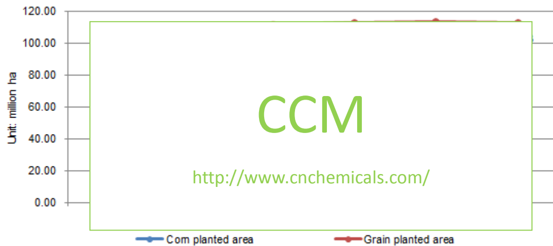
Figure 3.1-2 The corn and grain planted area in China, 2011–2016